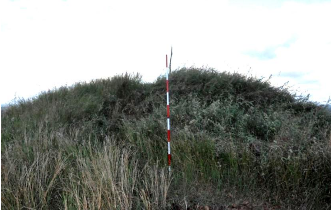
Artifact at Kunchanamale