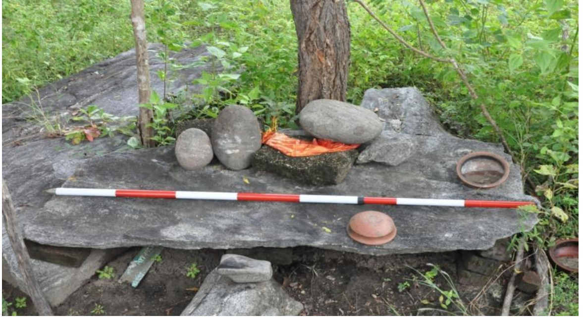
Artifacts at Toppigala.