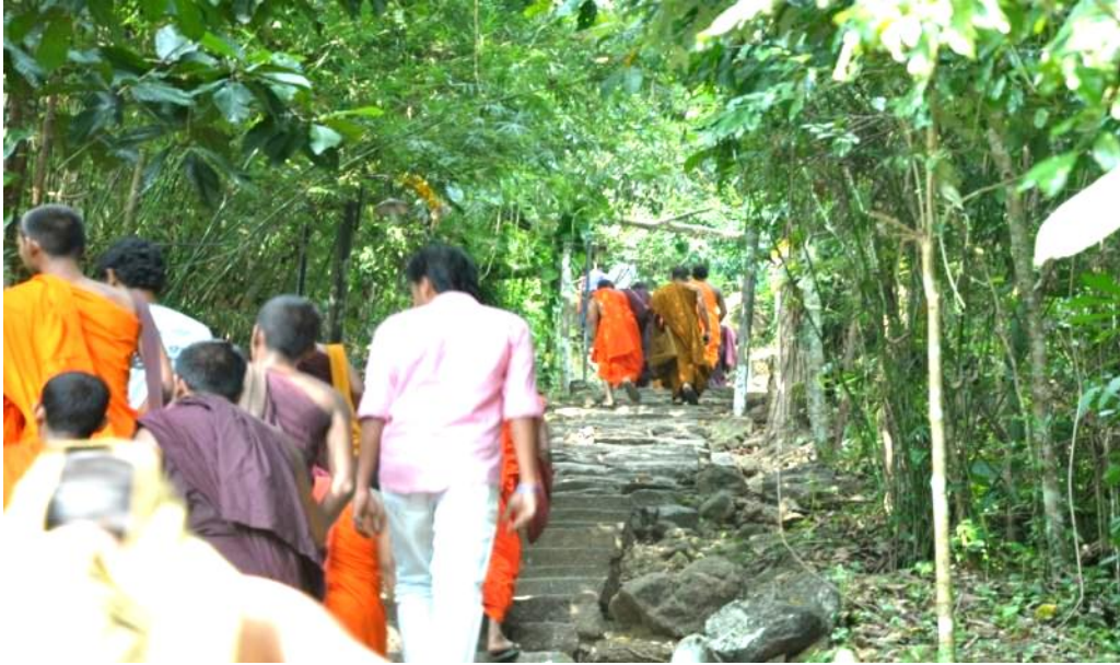
BPU Students stepping towards Pahiyan lena.