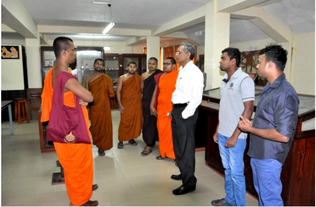
BPU Students Exchanging views with scholars at Jayawardenapura University.