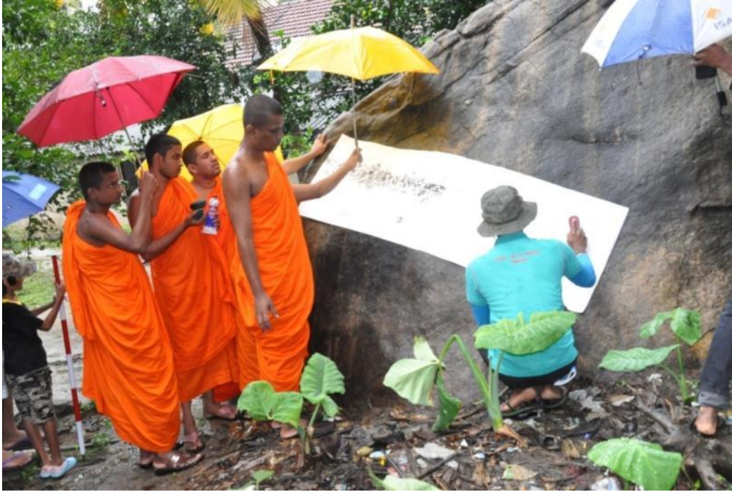
Students getting first hand Experience in copying an inscription through participatory observation at Kandegama Archaeological site.