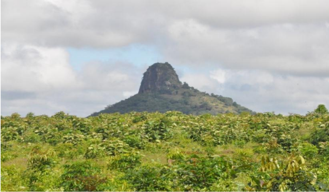
Archaeology site in Toppigala