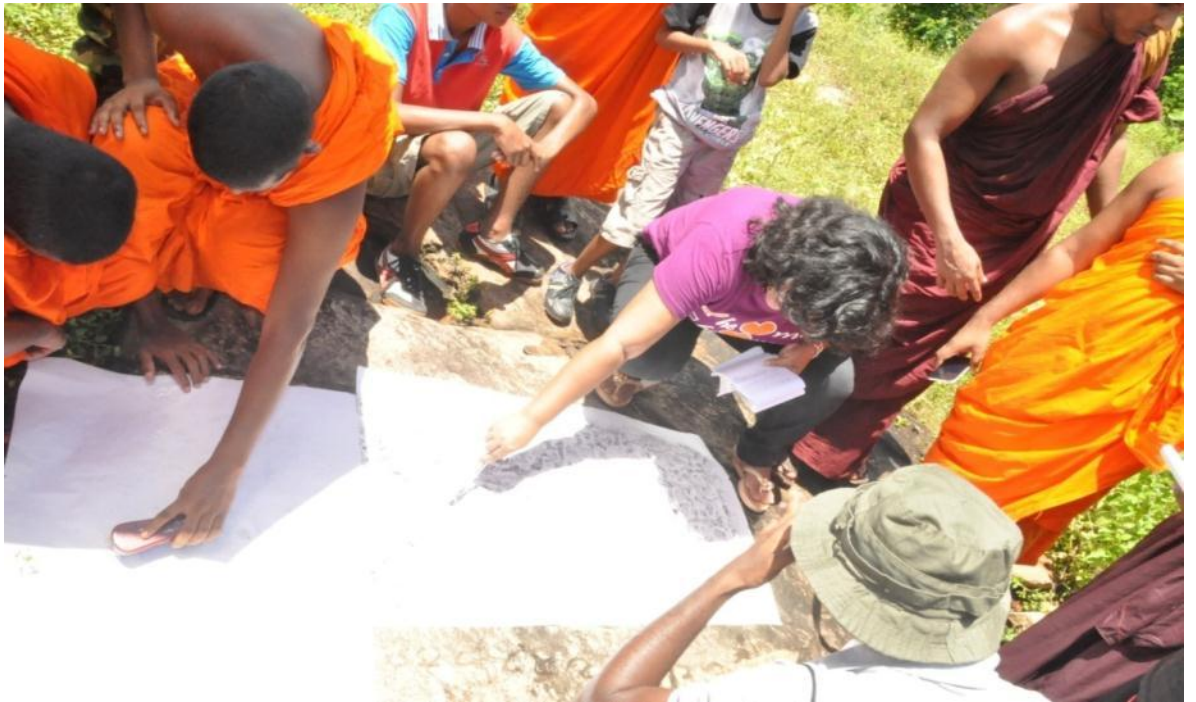
Copying of an Inscription at Toppigala.