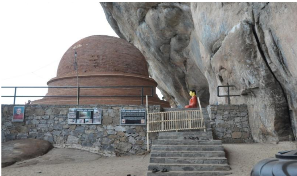
Stupa at Hennanigala