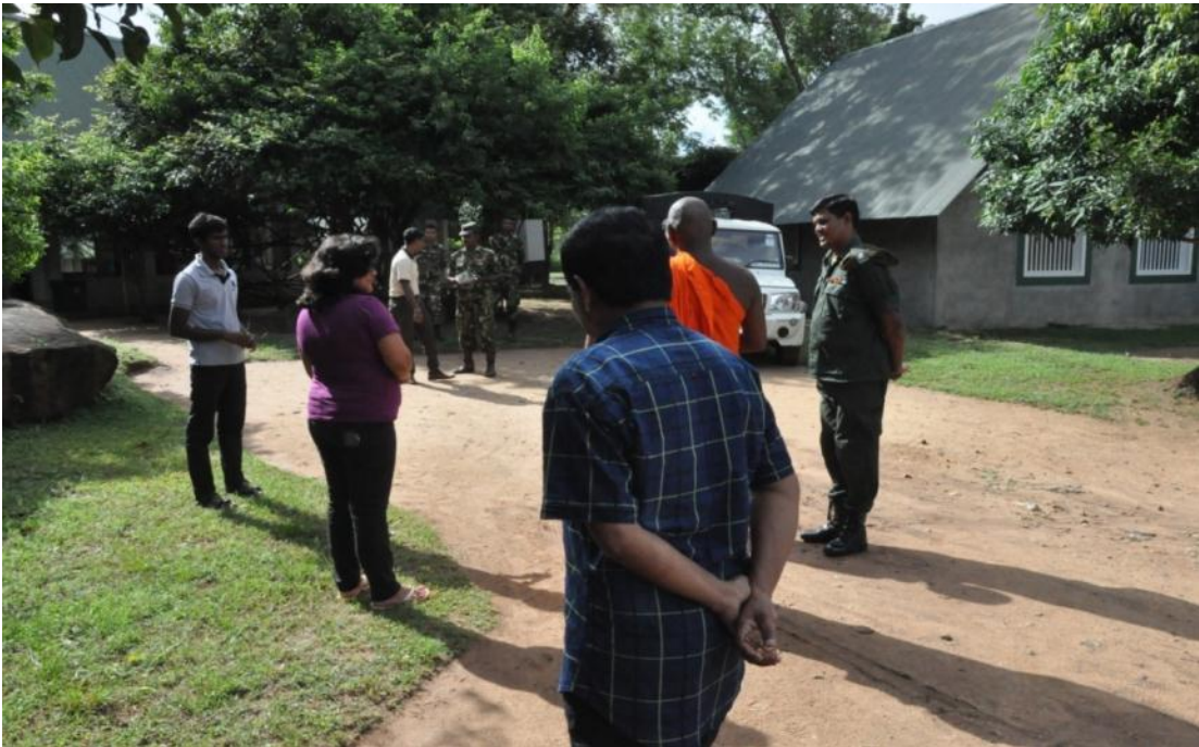
At the campsite in Toppigala.