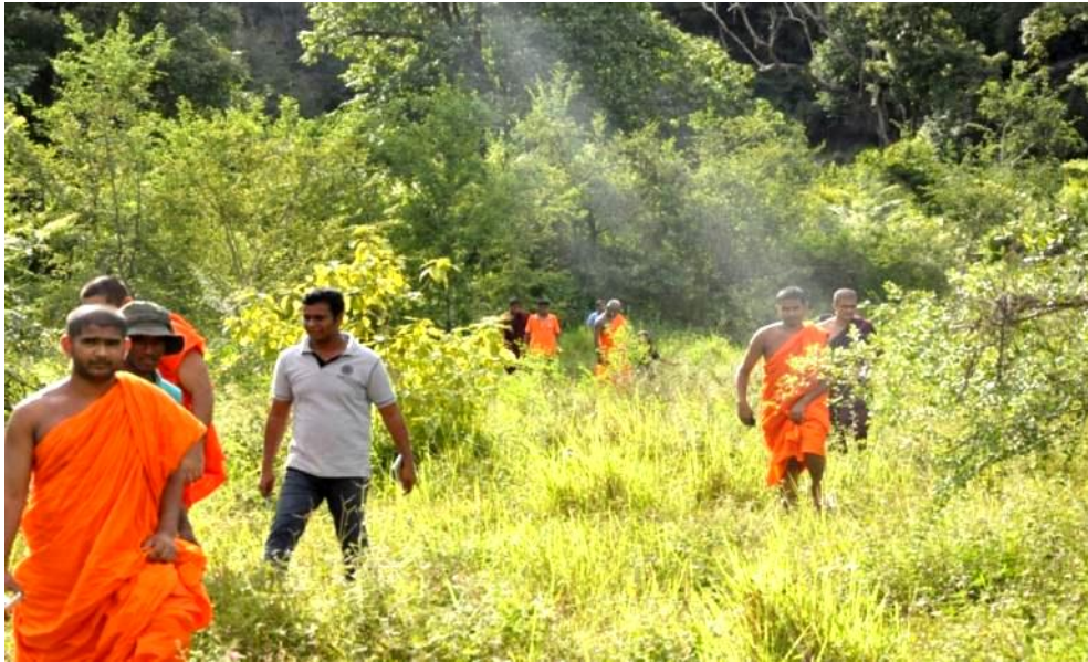
Archaeology site in Kandegama Kanda.