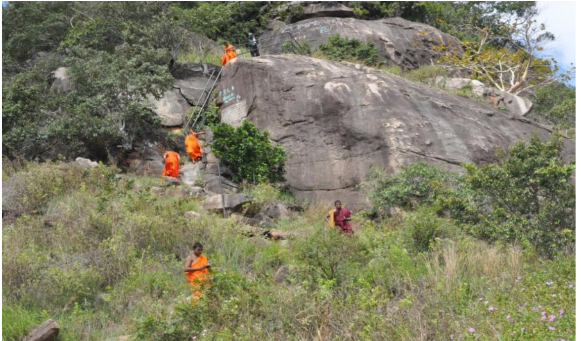
The tedious and adventurous towards the mountain peak.