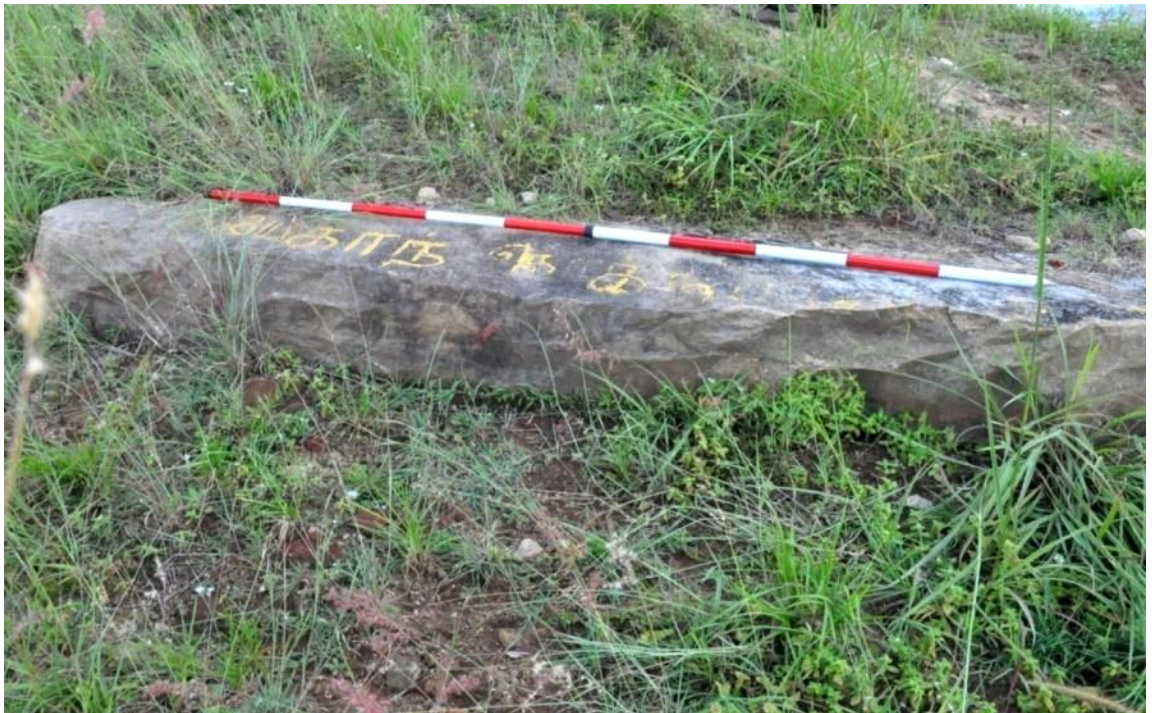
Artifacts at Toppigala.