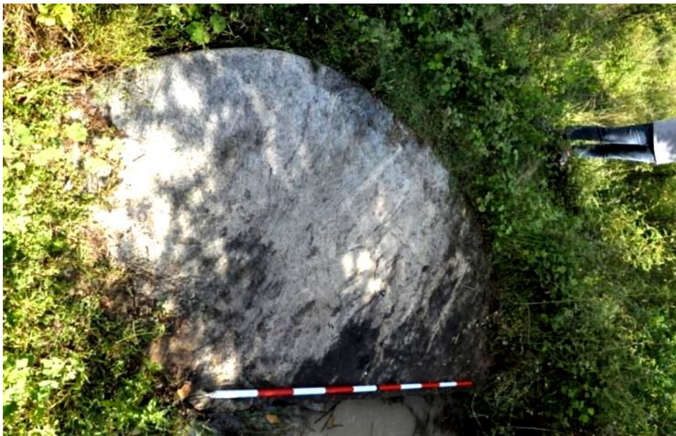
Artifacts at the Kandegama Kanda.