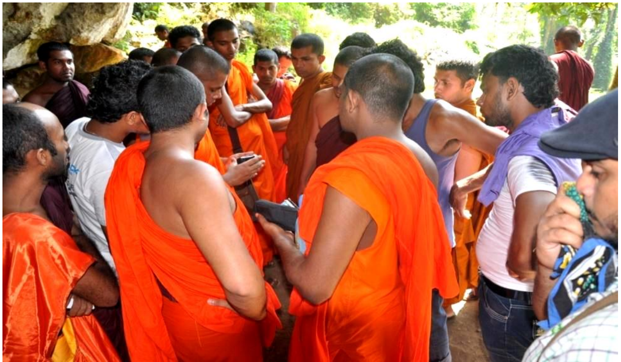
Discussion held at Batadombaleña.