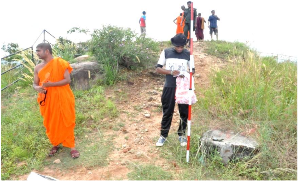
Ruins found in Toppigala.